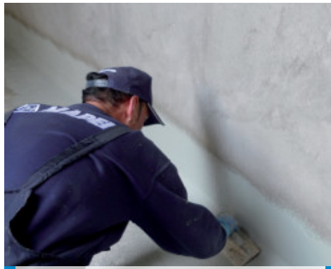
Mapelastic Foundation spread on by trowel to waterproof against water in negative pressure