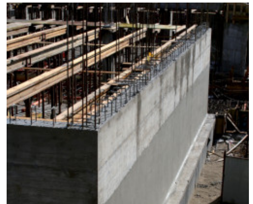
Retaining wall waterproofed after casting using Mapelastick Foundation