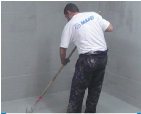
Mapelastic Foundation spread on by roller to waterproof against water in negative pressure